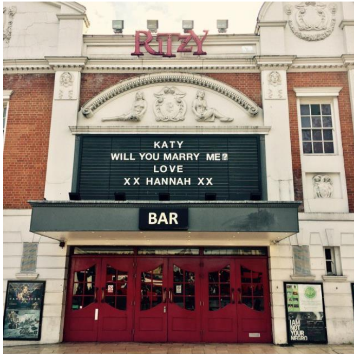
Brixton Personalised messages, monthly film quiz, DJs, yoga and Disney Karaoke!

Picturehouse look to open cinemas in the heart of communities that have previously been underserved by what they believe they can bring to the local area