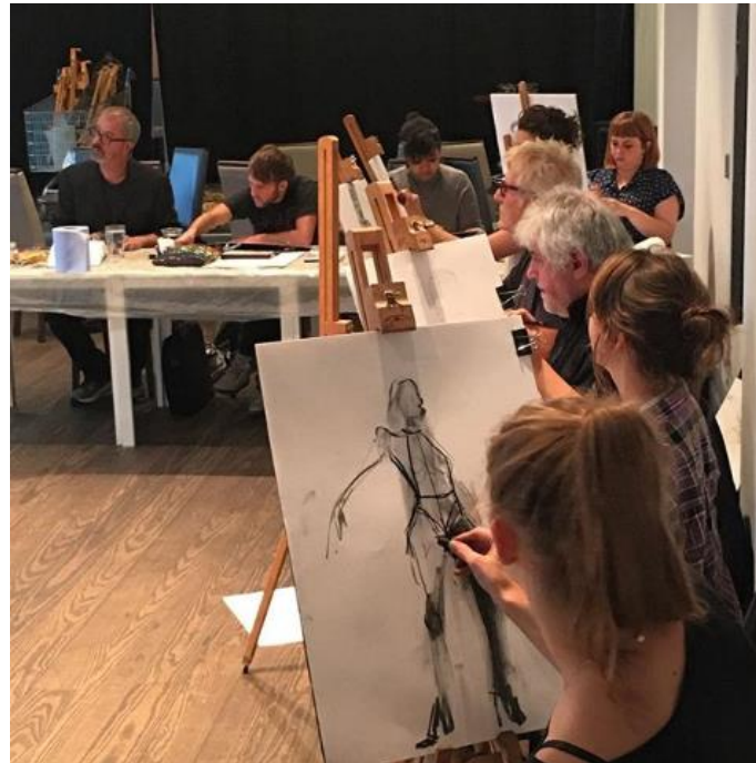
Hackney Life drawing, documentary festivals and Black History Studies events