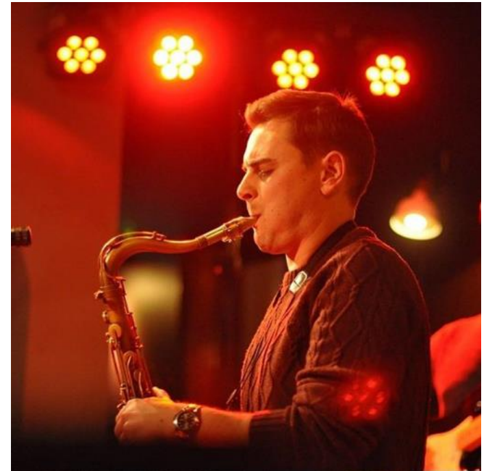
York Comedy club, spoken word shows and record fairs