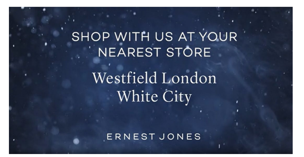
Highlighting nearest store to cinema to drive footfall