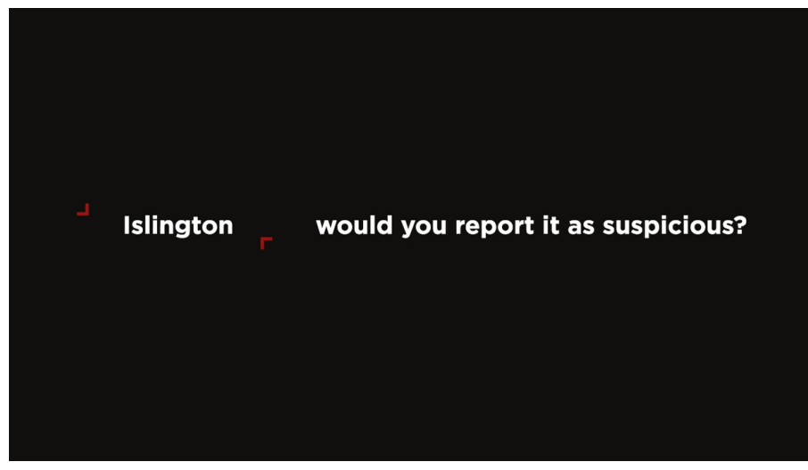
Targeting of key locations with tailored messaging