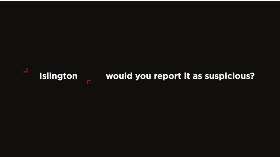
Targeting of key locations with tailored messaging