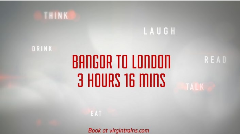
Promoting locally-relevant routes