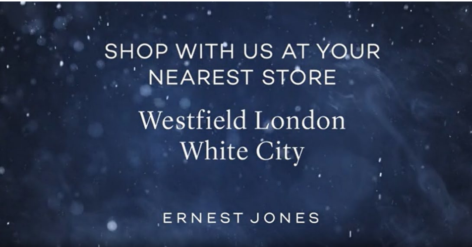
Highlighting nearest store to cinema to drive footfall