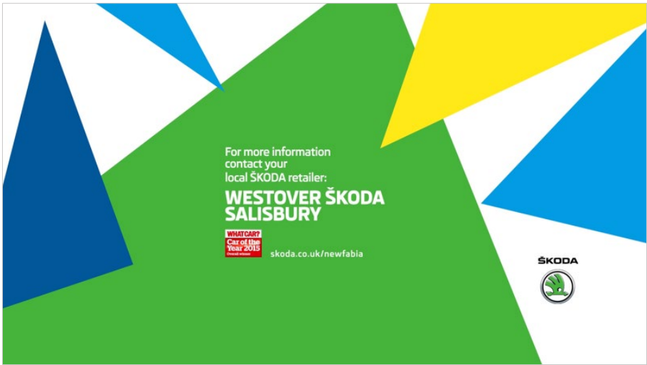
Showing nearest Skoda dealership