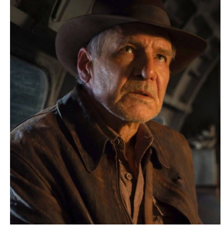
Indiana Jones And The Dial Of Destiny Index: 215