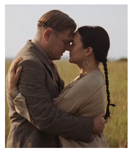
Killers of the Flower Moon 21% of DCM admissions