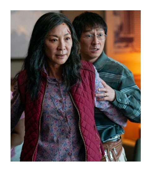
Everything Everywhere All At Once 30% of DCM admissions

Independents deliver 14% of all DCM admissions, but often a far higher proportion of Oscar winning movies