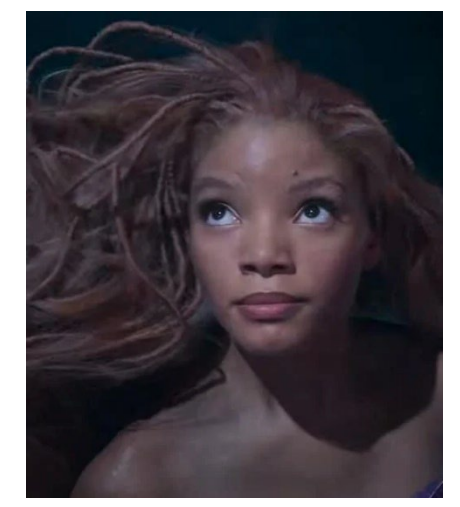
The Little Mermaid Index: 200