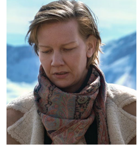
Anatomy of a Fall 67% of DCM admissions