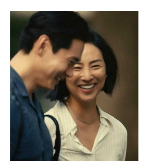
Past Lives 60% of DCM admissions