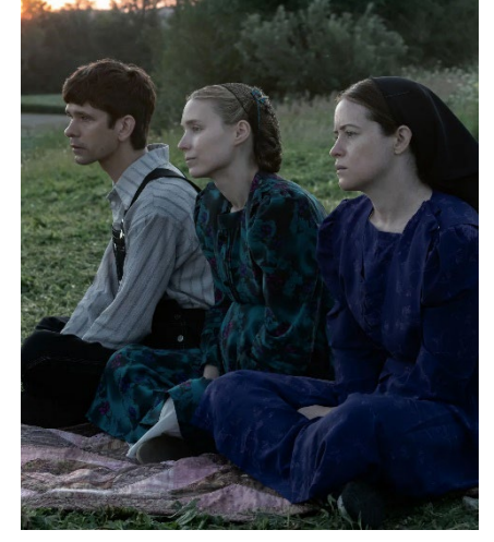
Women Talking 66% of DCM admissions