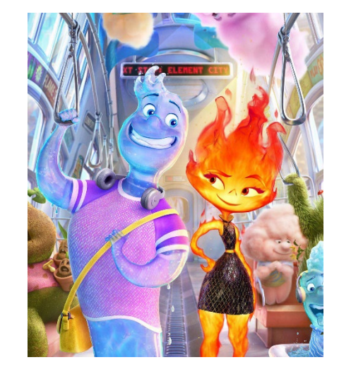
Elemental Index: 241

Independent cinemagoers also seek out quality blockbuster entertainment across the year