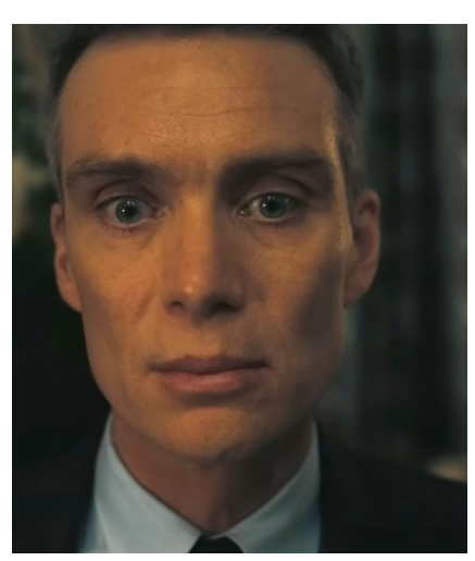
Oppenheimer Index: 219