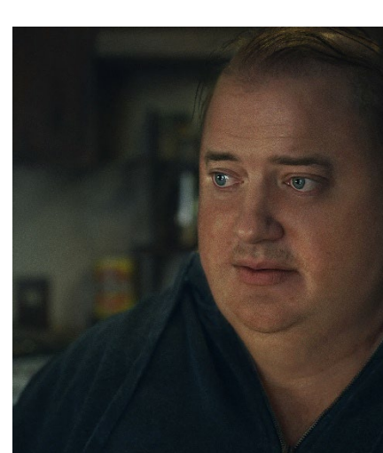
The Whale 28% of DCM admissions